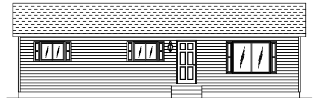
SAMPLE FRONT ELEVATION

***TRIPLE M HOUSING LTD. HAS AN UNSURPASSED COMMITMENT TO PRODUCT QUALITY AND INNOVATION. IN ORDER TO MEET AND EXCEED MARKET DEMANDS TRIPLE M RESERVES THE RIGHT TO MODIFY PLANS, SPECIFICATIONS AND/OR PRODUCT FEATURES AT ANY TIME WITHOUT PRIOR NOTICE. DUE TO PROVINCIAL, STATE AND/OR OTHER DESIGN REQUIREMENTS SOME VARIANCE IN STANDARD FEATURES MAY OCCUR. PLEASE CONSULT YOUR LOCAL TRIPLE M RETAILER FOR MORE INFORMATION.