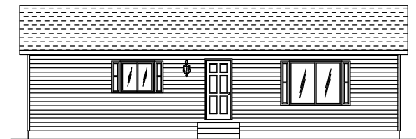
SAMPLE FRONT ELEVATION

***TRIPLE M HOUSING LTD. HAS AN UNSURPASSED COMMITMENT TO PRODUCT QUALITY AND INNOVATION. IN ORDER TO MEET AND EXCEED MARKET DEMANDS TRIPLE M RESERVES THE RIGHT TO MODIFY PLANS, SPECIFICATIONS AND/OR PRODUCT FEATURES AT ANY TIME WITHOUT PRIOR NOTICE. DUE TO PROVINCIAL, STATE AND/OR OTHER DESIGN REQUIREMENTS SOME VARIANCE IN STANDARD FEATURES MAY OCCUR. PLEASE CONSULT YOUR LOCAL TRIPLE M RETAILER FOR MORE INFORMATION.