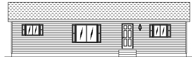
SAMPLE FRONT ELEVATION

***TRIPLE M HOUSING LTD. HAS AN UNSURPASSED COMMITMENT TO PRODUCT QUALITY AND INNOVATION. IN ORDER TO MEET AND EXCEED MARKET DEMANDS TRIPLE M RESERVES THE RIGHT TO MODIFY PLANS, SPECIFICATIONS AND/OR PRODUCT FEATURES AT ANY TIME WITHOUT PRIOR NOTICE. DUE TO PROVINCIAL, STATE AND/OR OTHER DESIGN REQUIREMENTS SOME VARIANCE IN STANDARD FEATURES MAY OCCUR. PLEASE CONSULT YOUR LOCAL TRIPLE M RETAILER FOR MORE INFORMATION.