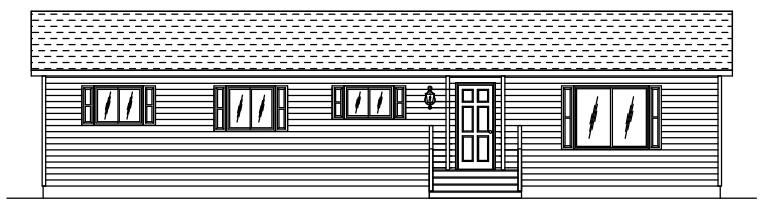
SAMPLE FRONT ELEVATION

***TRIPLE M HOUSING LTD. HAS AN UNSURPASSED COMMITMENT TO PRODUCT QUALITY AND INNOVATION. IN ORDER TO MEET AND EXCEED MARKET DEMANDS TRIPLE M RESERVES THE RIGHT TO MODIFY PLANS, SPECIFICATIONS AND/OR PRODUCT FEATURES AT ANY TIME WITHOUT PRIOR NOTICE. DUE TO PROVINCIAL, STATE AND/OR OTHER DESIGN REQUIREMENTS SOME VARIANCE IN STANDARD FEATURES MAY OCCUR. PLEASE CONSULT YOUR LOCAL TRIPLE M RETAILER FOR MORE INFORMATION.